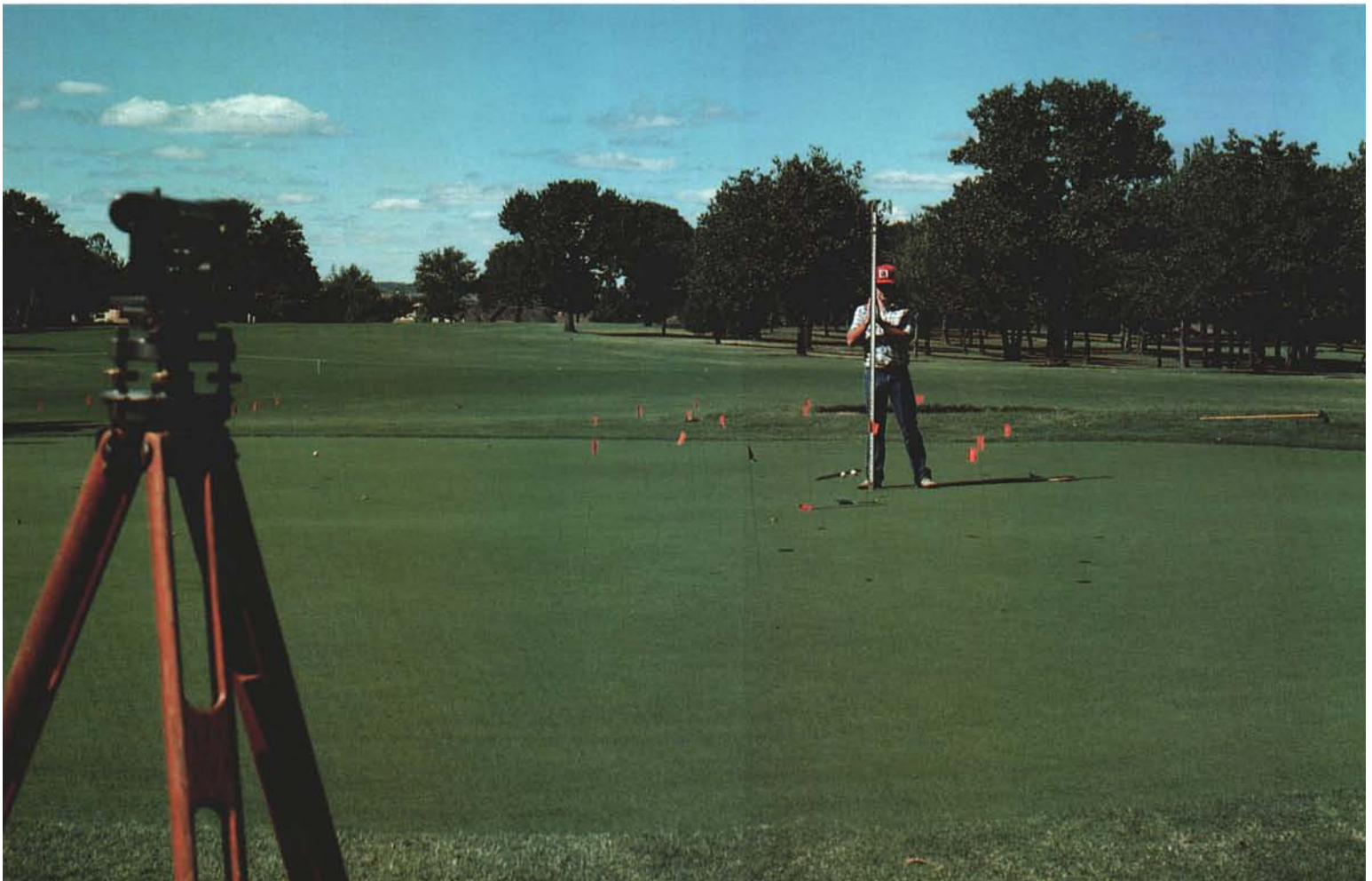
Figure 1. A formula (see text) was derived that corrects for slope in green speed readings. Here, the actual angles of inclination are checked before validation of the formula on the Stillwater (Oklahoma) Country Club.

Getting permission to set foot on these courses was not always easy. Some superintendents were surprised to see two tired, tee-shirted students who wanted to check the speed of their